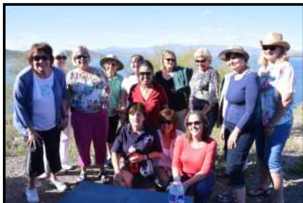
The real past commanders —The distaff side of squadron activities pose for the camera at last month's past commanders' barbecue at Lake

Continue on 59th Lane & it becomes W Robin Ln.